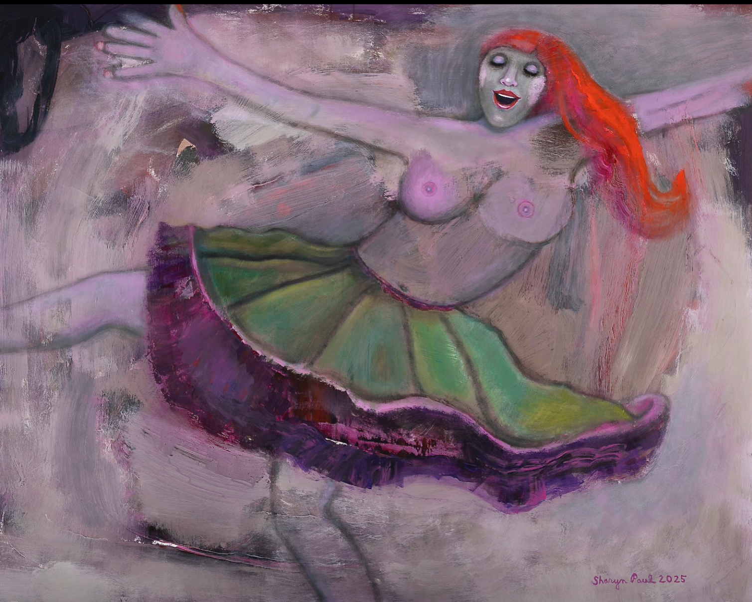
Sharyn Paul Brusie, Rebel, 2025, Oil and Acrylic on Canvas, 48 x 60 inches