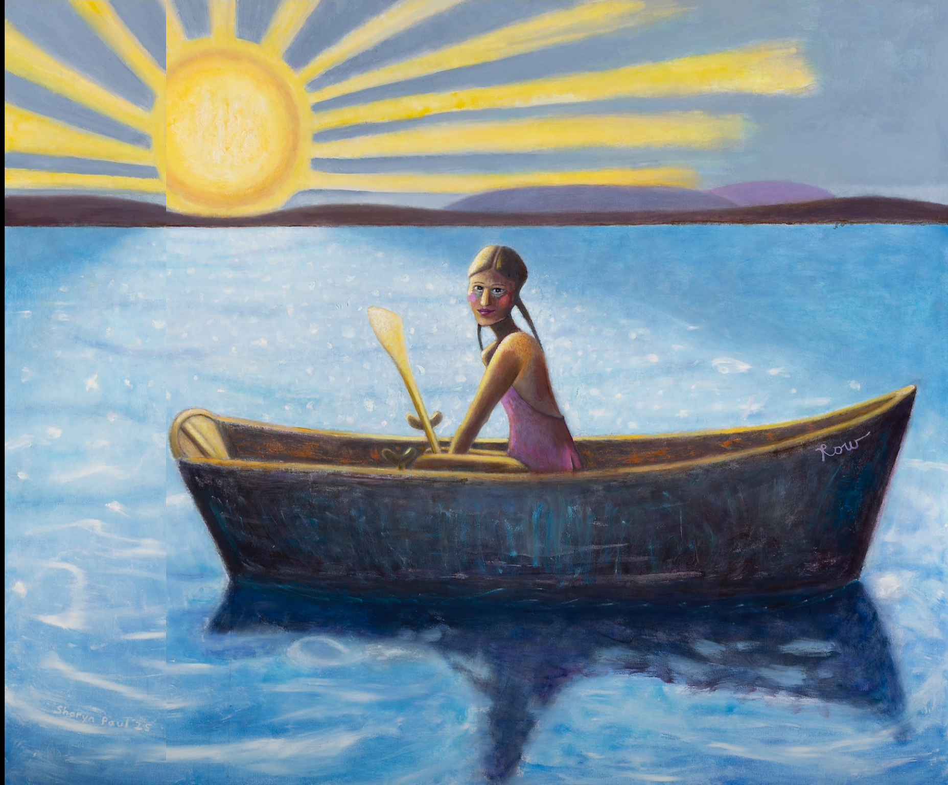
Sharyn Paul Brusie, Silent Contemplation, 2025, Oil and Acrylic on Canvas, 60 x 72 inches