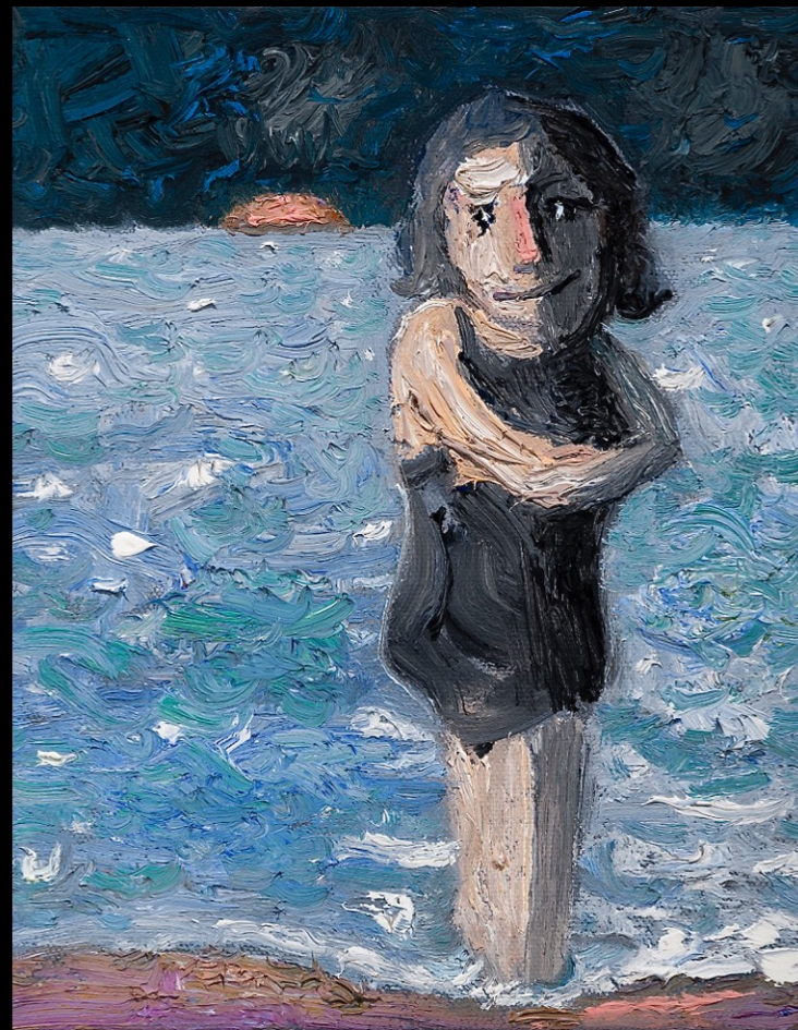
Sharyn Paul Brusie, Fast Storm Approaching, 2025, Oil on Canvas, 10 x 8 inches