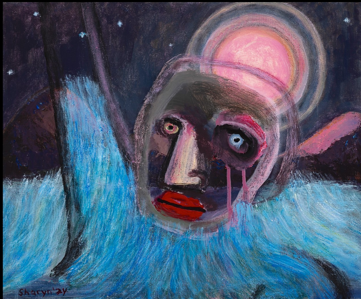
Sharyn Paul Brusie, Moonlight Swim, 2024, Acrylic on Canvas, 16 x 20 inches