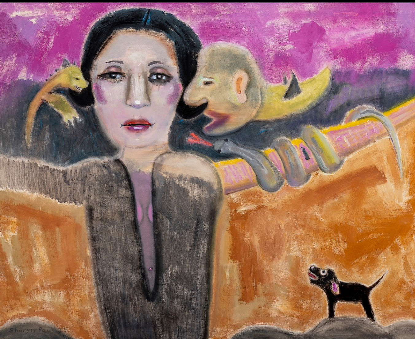
Sharyn Paul Brusie, Momma, Don't Believe Them, 2025, Oil on Canvas, 36 x 48 inches