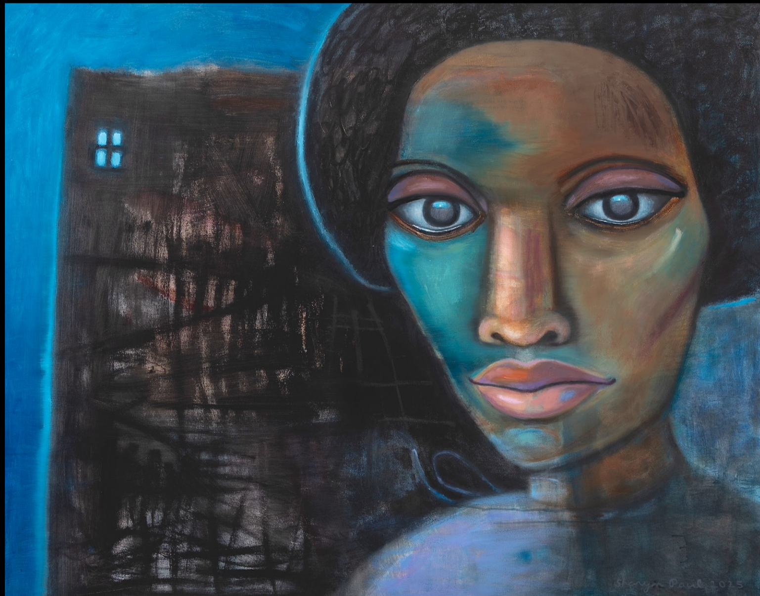
Sharyn Paul Brusie, Second Opinion, 2025, Oil and Acrylic on Canvas 48 x 60 inches