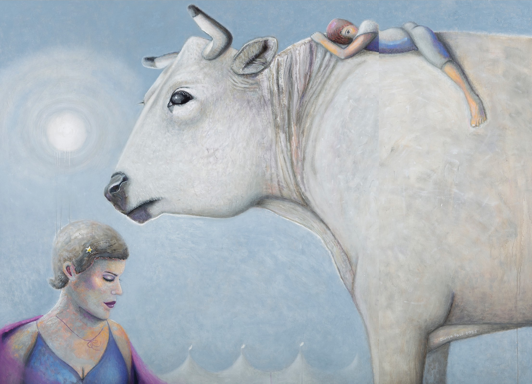
Sharyn Paul Brusie, Gentle Passage, 2025, Oil and Acrylic on Canvas, 60 x 84 inches