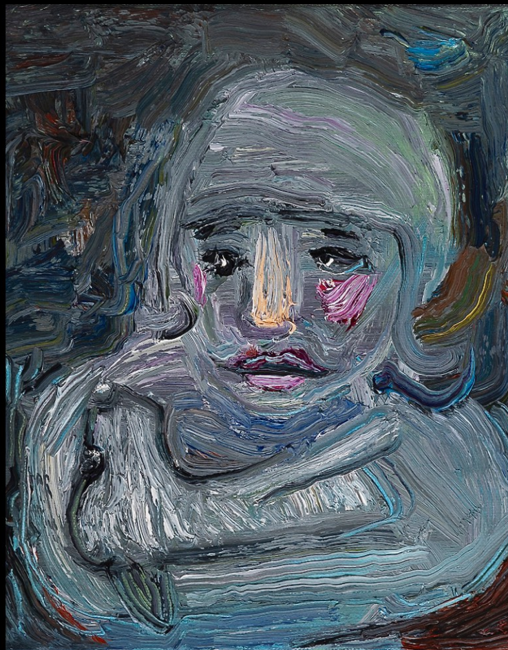
Sharyn Paul Brusie, Cradle, 2025, Oil on Canvas, 10 x 8 inches