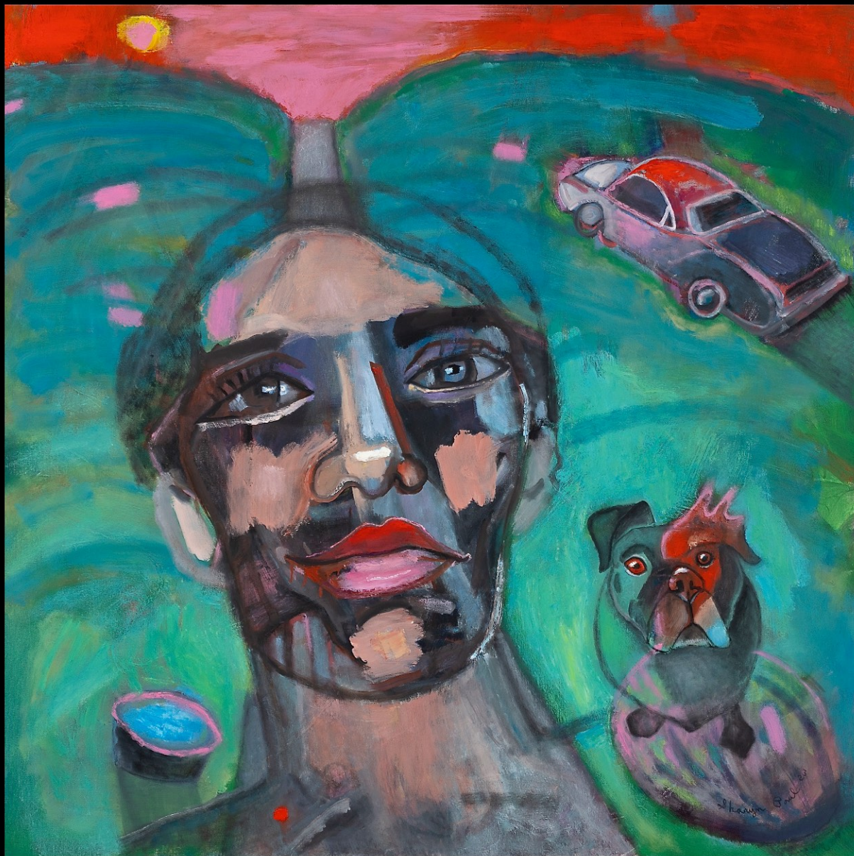
Sharyn Paul Brusie, Riding Through Mount Desert Island, 2023, Acrylic and Oil on Canvas, 48 x 48 inches