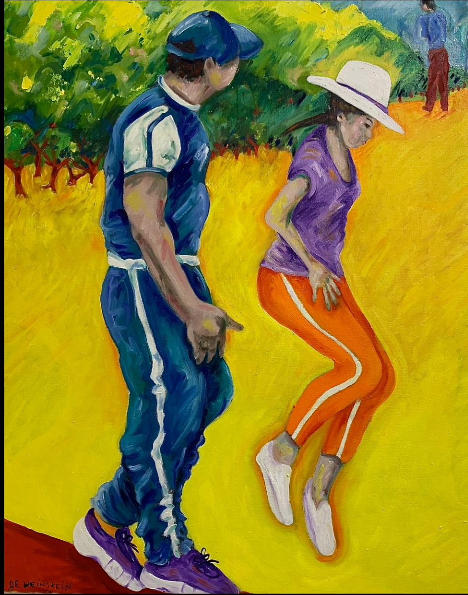
Joyce Ellen Weinstein, Jump, 2018, Oil on Canvas, 32 x 26 x 1 inches