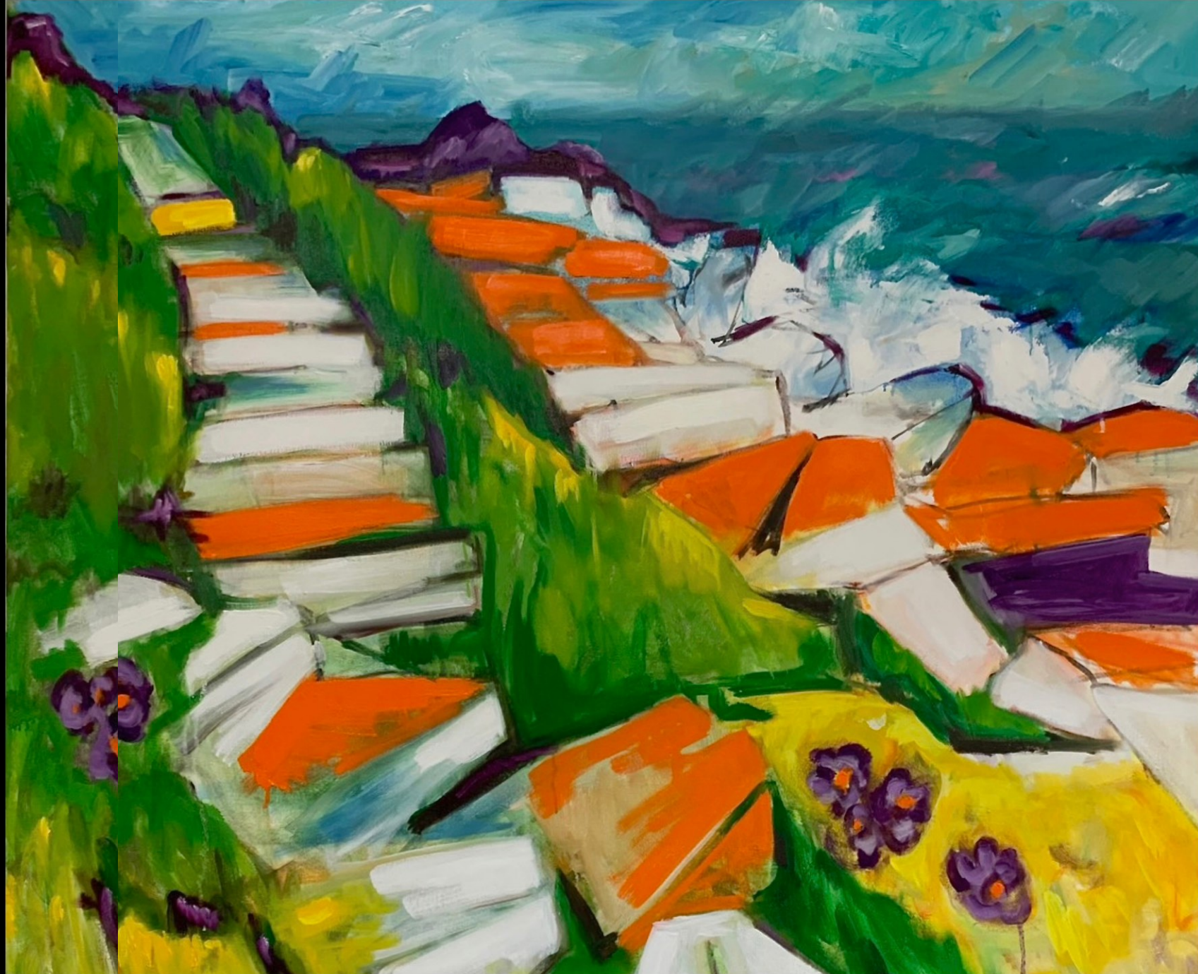
Joyce Ellen Weinstein, Orange Lichen at Two Lights, 2022, Oil on Canvas, 36-1/2 x 42-1/2 x 1-1/2 inches