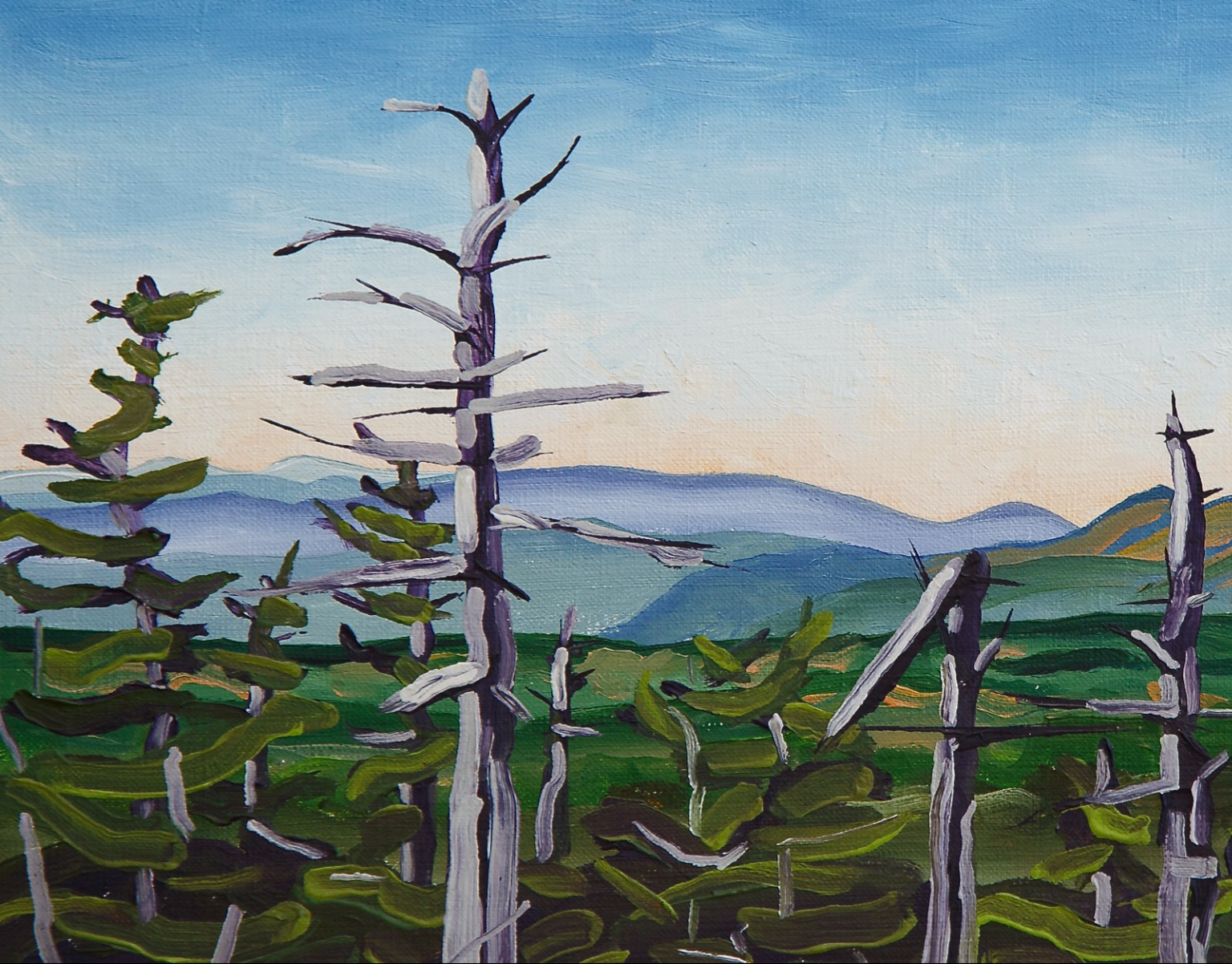
BRIAN KREBS | TIMBERLINE